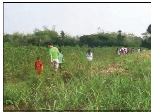
...and then away they go....