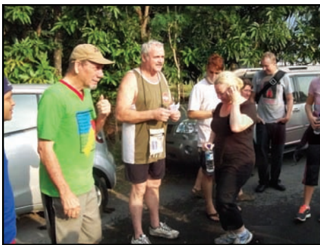
But first, a few words of explanation....