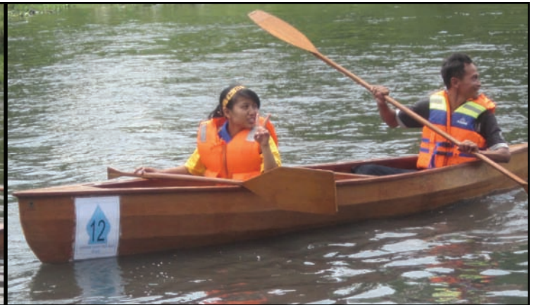
Pirates telling other Pirates off !