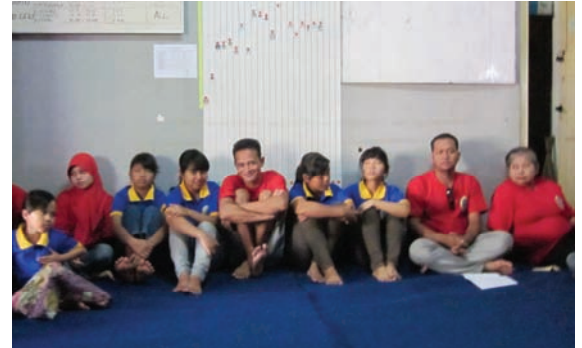
Listening patiently and attentively to the Foundation President's speech, while look forward to getting off to the waterpark.