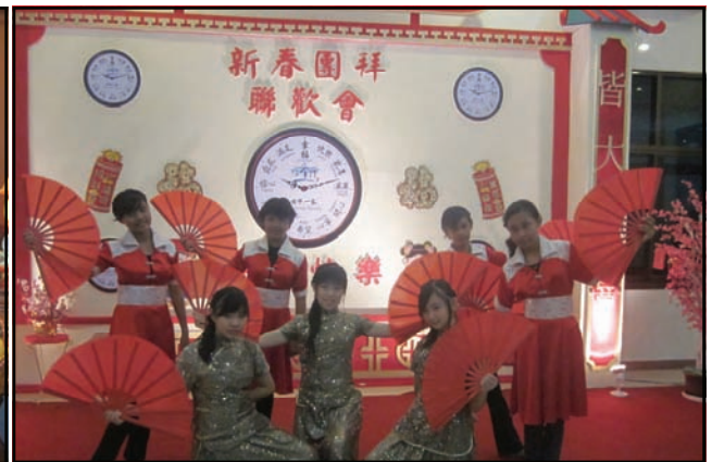
A successful country, a safe and peaceful world, blessed with the love of life, a wonderful world for sure. (INLA Song lyrics)