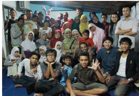
Ramadhan Ceria Ar-Raudhah