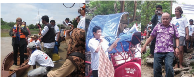
Head of the Solo City Tourism Board officially starts the first race With help from MC from the Vihara Meytria Muni.