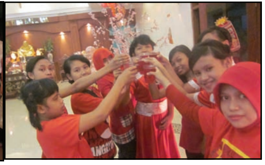
Celebrating Chinese New Year