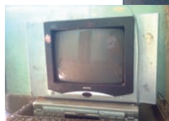
Small & Ugly