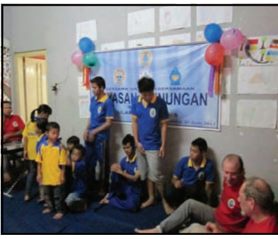
The children have practiced for days beforehand and now come forward to sing their song. The gossiping adults not listening so patiently and attentively .....