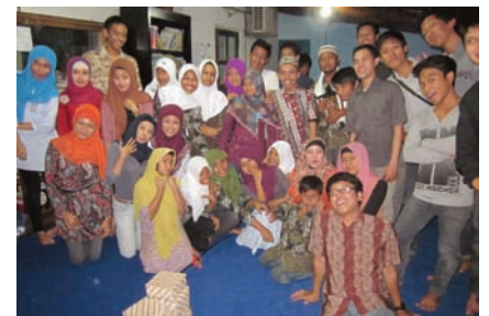
Fakultas Ekonomi UNS