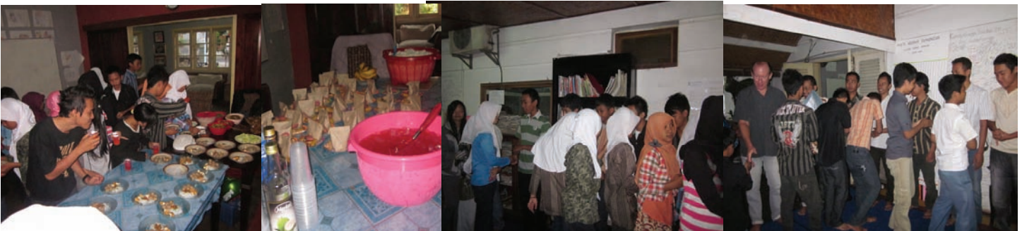
After days of fasting is complete, we held an Aid Mubarak. Forgive each other, and of course a feast!