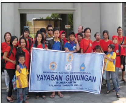
The birthday banner was brought along. Thanks so much to the Pandhawa WaterPark for giving us such generous discounts on the kids.