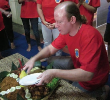
Cutting the top off the rice cone. In other parts of the world it would be slicing the cake. Must love the Javanese traditions!

In 2011 we celebrated the fifth anniversary of the Gunung Foundation. We held a 'get together' at the Children's Refuge with all the divisions of the Foundation coming together to celebrate. After the usual speeches, eating and a bit of singing we all set off for the main event, a trip to Pandhawa WaterPark in nearby Solobaru. We had been planning on taking the kids there for a while now, so it was great to eventually be going. In 2012 we also celebrated the Foundation's sixth anniversary with a trip to a WaterPark, but this time as part of a combined trip with the Solo Expats Association (SEA) to Gajar Mungkur in Wonogiri. Although it may seem from the newsletters that we are always going on outings, in fact we usually manage just two or three a year. They are something the children really look forward to, and again, something that would not be possible without all your help, thank you. Below are some pictures taken during the fifth anniversary celebration.