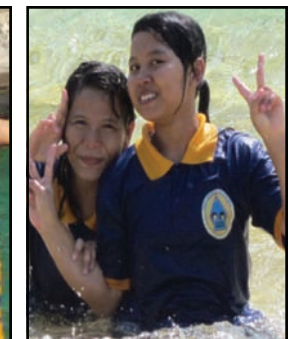
Fun, fun, fun splashing around in the Sun. The kids had a great time, floating around on rubber tubes, playing in the waves, careering down the water slides....and taking more photos of themselves...