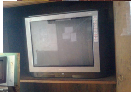
To the victors the spoils - Big & Good