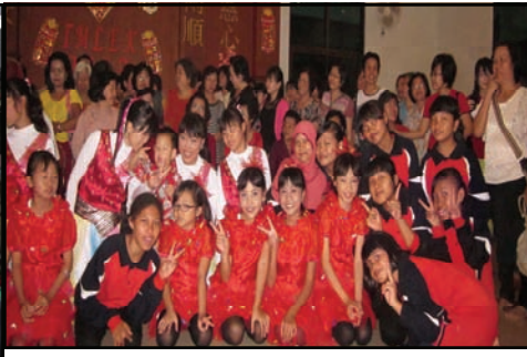
Joining the Events of Chinese New Year