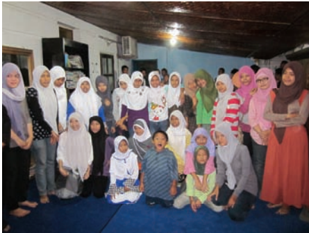
Al Islam High Schol Kelas IX

Ramadan in 2012 and once more there were lot of guests who invited the children to break the fast with them. Almost every evening there was an event. The kids really enjoyed it. Meeting new people, sharing experiences, gaining knowledge, playing games, eating together, and of course the gifts. Indeed, guests did not come alone, they brought with them a community of reptiles, jugglers, bands, singers, and more. The children were also invited on a train ride on the old steam train that still runs through the city center, the Jaladara train. Some guests who had visited in the previous year returned again this year as they had been so taken with the kids. Thank you to all who have participated and graced the Ramadan atmosphere for our children. See you at the next Ramadan. And of course Happy Eid!