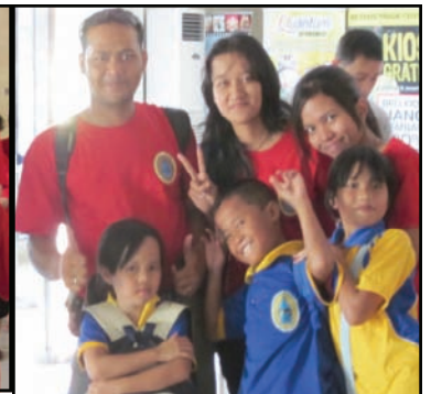
Posing for photos before going in to the park.