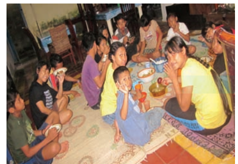
No guests? Then we'll make our own event