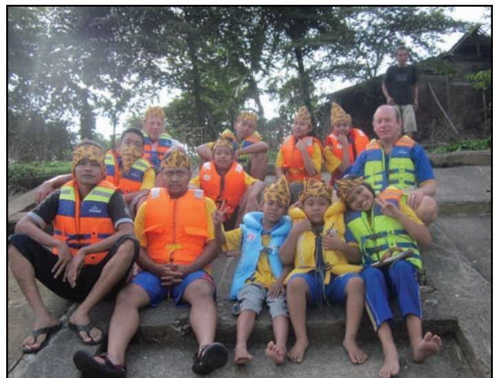
The motley crew ....