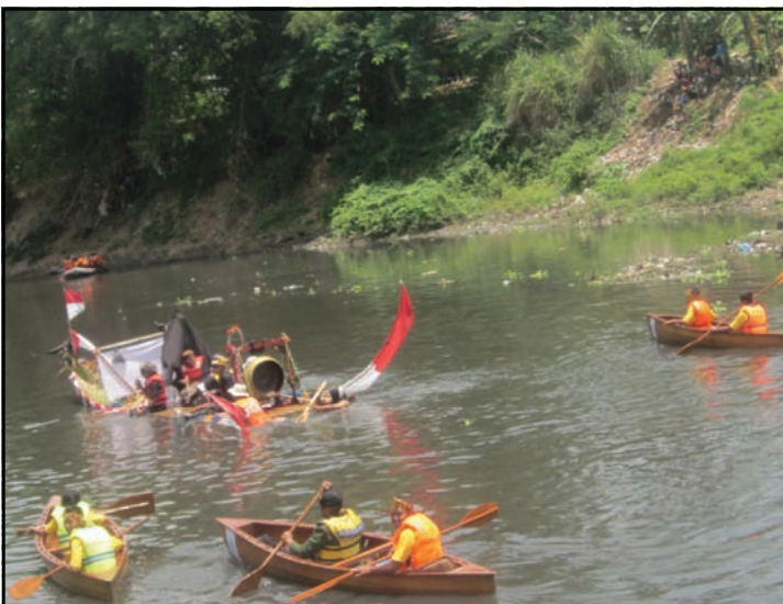
Down goes a bamboo raft! (It wasn't us - honest!)