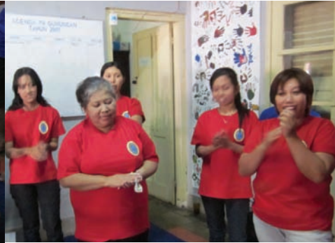
Singing 'Happy Birthday' together. Unfortunately there are no birthday songs in Indonesia, so it ends up being a bit of a hotch-potch of the English tune to Indonesian lyrics...Nice all the same.