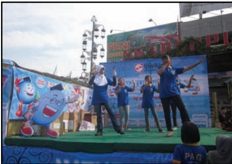
Dancing on stage as the main road in Solo City Center closes for 'Car Free Day'