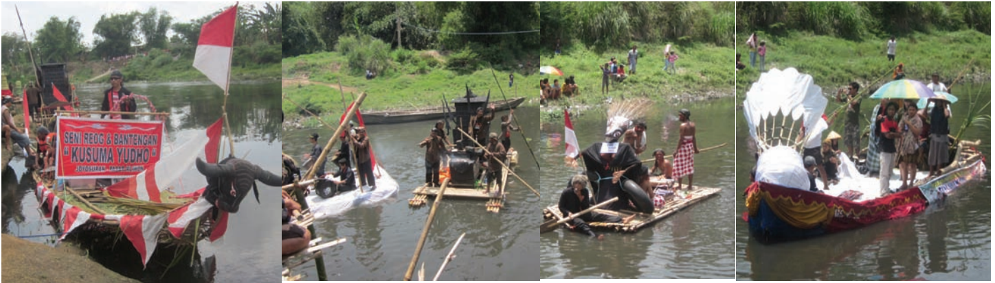
The serious Rafterers