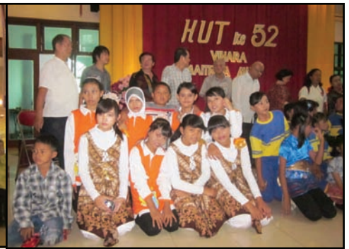
Dancing at the 52nd anniversary of the Meytria Muni Temple