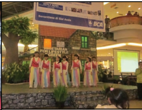
Dancing at the "Viva La Vegan" event in the Solo Square Mall