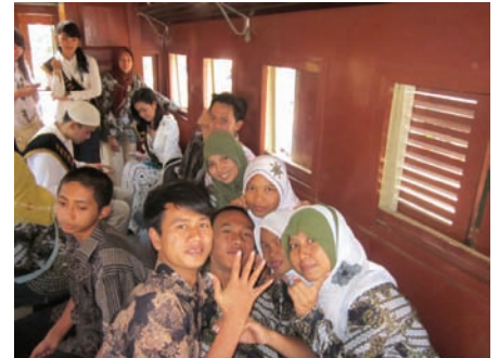
Lor In Hotel & Jaladara steam train