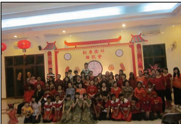
Refuge Children together with the members of Vihara Meytria Muni Temple Surakarta