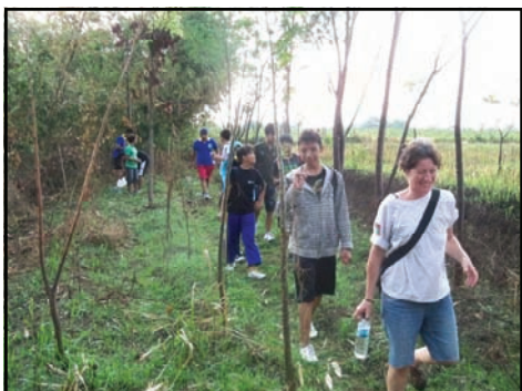
Someone walking along and chatting with her hands in her pockets - You know who you are!!.....