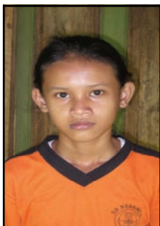
Dila 12 yrs