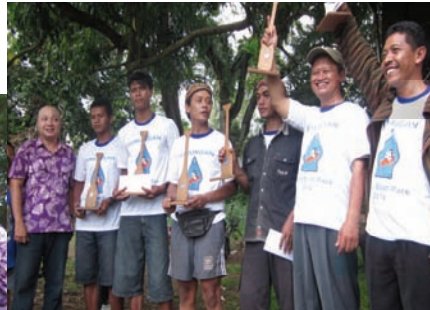
The final race winner was one of the Heads of the local Government.

The slogan "Solo - comfortable and memorable" also being applied to the Bengawan Solo River