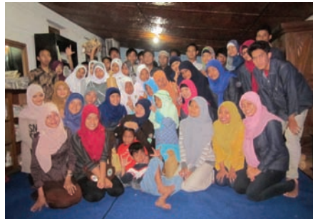
UNS University Psychology Dept