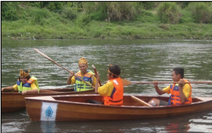
Pirates attacking Pirates !