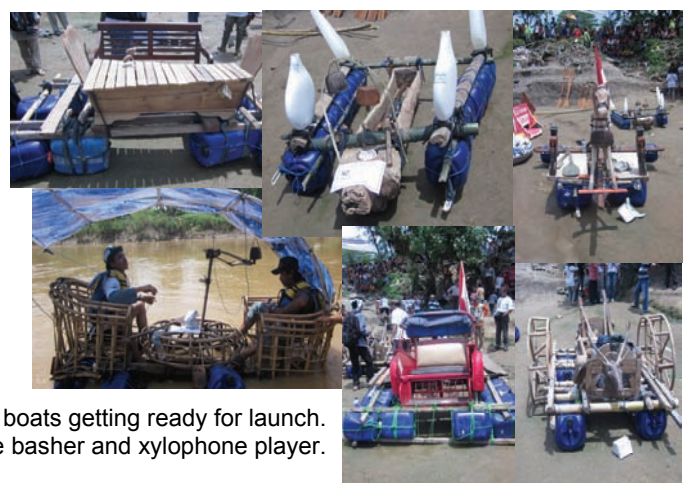
Right: Just a few of the funny boats getting ready for launch. Creations included a hobby horse, rice basher and xylophone player.