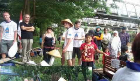
Many foreigners also supported the event