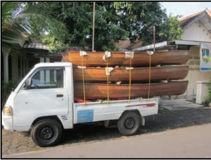
The Gunungan canoes ready for action. We finally made 12 canoes which are used in the Gunungan Charity Boat Race as well as for fun days out exploring the waterways of Central Java.

Solo city holds many cultural events during the year, such as the 'Solo Batik Carnaval', but only two such events are held on the mighty Bengawan Solo River. One is the Gunungan Charity Boat Race, and the other, usually around November time as the rainy season has just started and the river is beginning to flow again, is the Solo Gethek Festival. This is a traditional bamboo raft parade down the river, remembering times gone by, when the waterways of Java were the main means of trade and getting around.