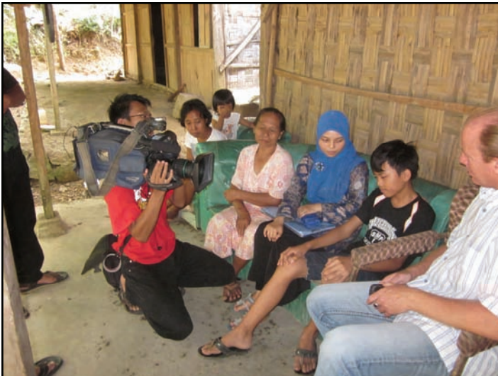
Survey to assess the living conditions of a child where an application has been made to enter the Children's Refuge

Or search YouTube for "Gunungan Orphanage"