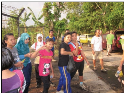
Chomping at the bit to get going....

In celebration of their 50th run, the Solo Hash House Harriers invited the children from the Gunungan Children's Refuge to come and join in with their cross country paper chase on 21 October 2012 - this special edition run being specially designed for younger members with challenges and prizes along the way. Admittedly some of the kids were a bit shocked when they heard they were actually expected to do a cross country run, but excited anyway they all donned running shoes ready for the off - also a bit relieved when they heard it was actually okay to walk if they wanted.